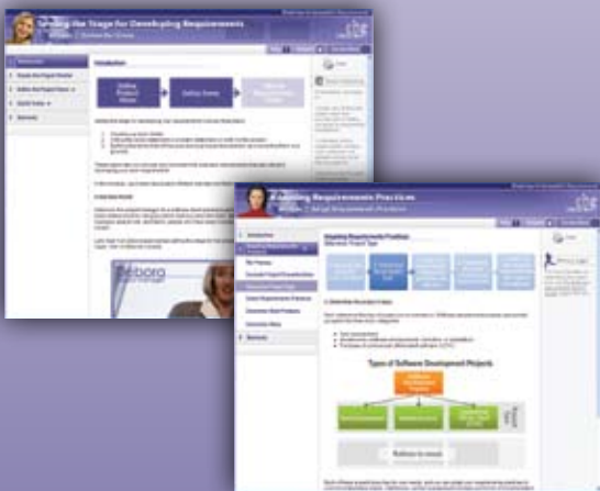
Screenshots from EBG's eLearning curriculum: Roadmap to Success: Foundation for Requirements Development and Management

For 17 years, EBG Consulting has leveraged its extensive, real-world experience to tackle the toughest problems with product development, business analysis, requirements and team collaboration to: